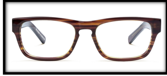
ROOSEVELT (in Striped Chestnut)