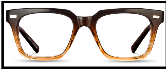
WINSTON (in Old-Fashioned Fade)