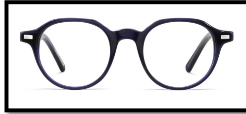
BEGLEY (in Midnight Blue)