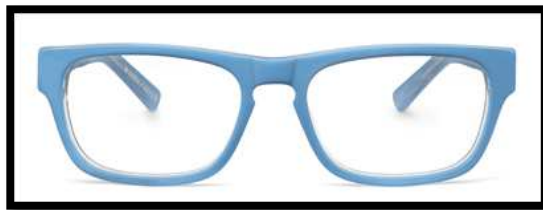
ROOSEVELT (in Bondi Blue)