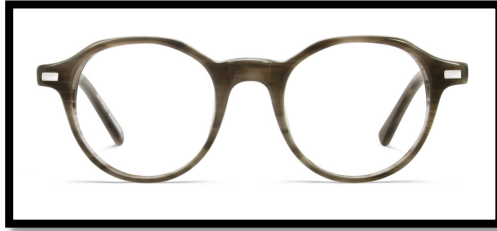
BEGLEY (in Greystone)