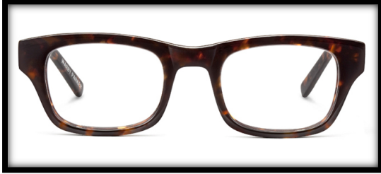
HUXLEY (in Whiskey Tortoise)