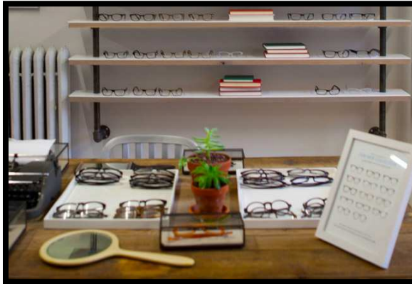
Exhibit 8 Warby Parker Showrooms