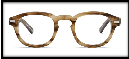
FILLMORE (in Sandalwood Matte)