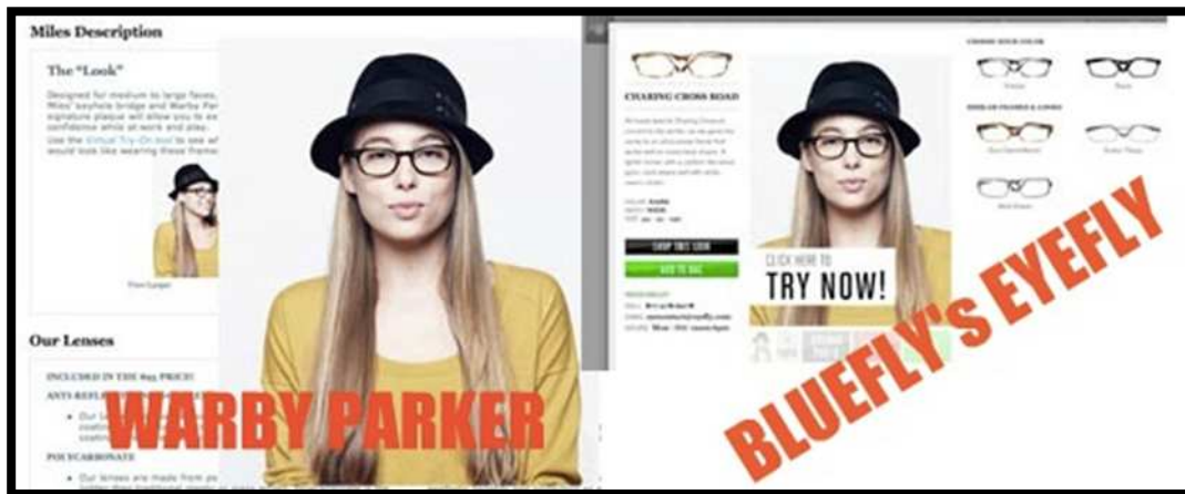
Exhibit 10 Warby Parker Photo on Eyefly Website

Source: Danica Lo, “Bluefly’s Eyefly Rips Off Idea, Steals Warby Parker’s Product Photos,” Racked , June 3, 2011, http://racked.com/archives/2011/06/03/blueflys-eyefly-rips-off-idea-steals-warby-parkers-product-photos.php , accessed January 2012. For Bluefly’s apology, see Danica Lo, “Bluefly’s Eyefly Says Sorry for Using Warby Parker’s Product Image,” Racked , June 2, 2011, http://racked.com/archives/2011/06/03/blueflys-eyefly-says-sorry-for-using-warby-parkers-product-image.php , accessed January 2012.